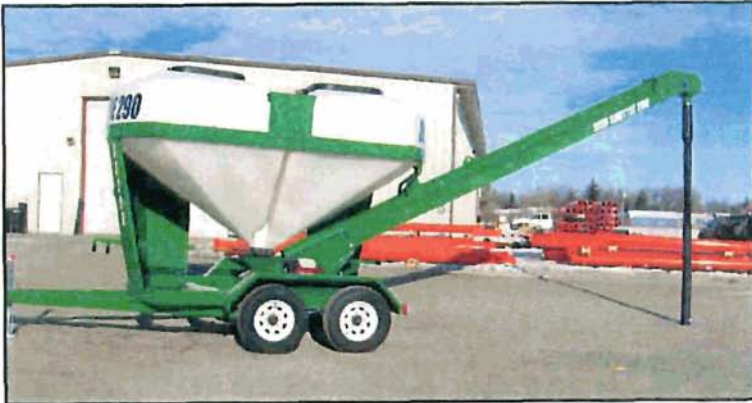
8" diameter tube, 10" wide all rubber belt and a 23' long conveyor for extra reach