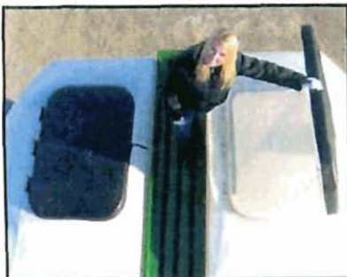
2 - 45" X 27" sealed lid openings with 18" wide catwalk