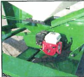
5.5 Honda motor, battery and variable flow controls